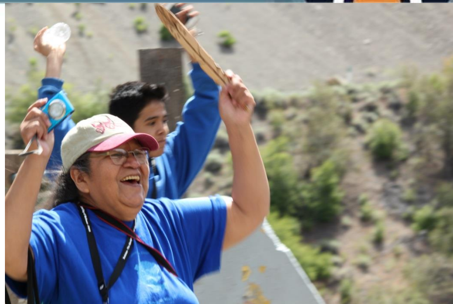
At Xwisten, Elder completing first 10km run!