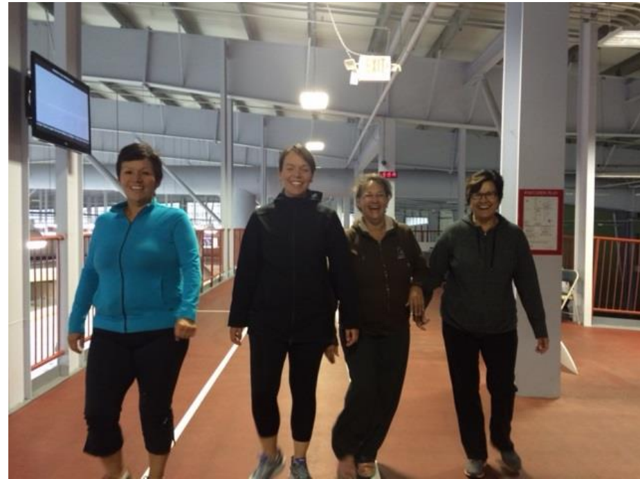
Team North getting some early morning steps