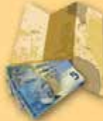
Local maps (identify a family meeting place) and some cash in small bills