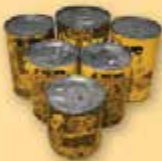
At least a three-day supply of non-perishable food. Manual can opener for cans