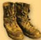
Seasonal clothing and footwear