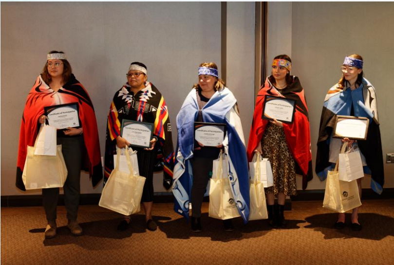
April 2023 End of Term Ceremony

We take into account your studies – we also look at your interests and top choices