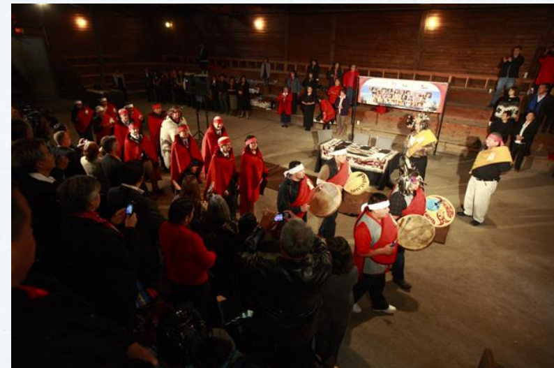
First province-wide health authority of its kind in Canada