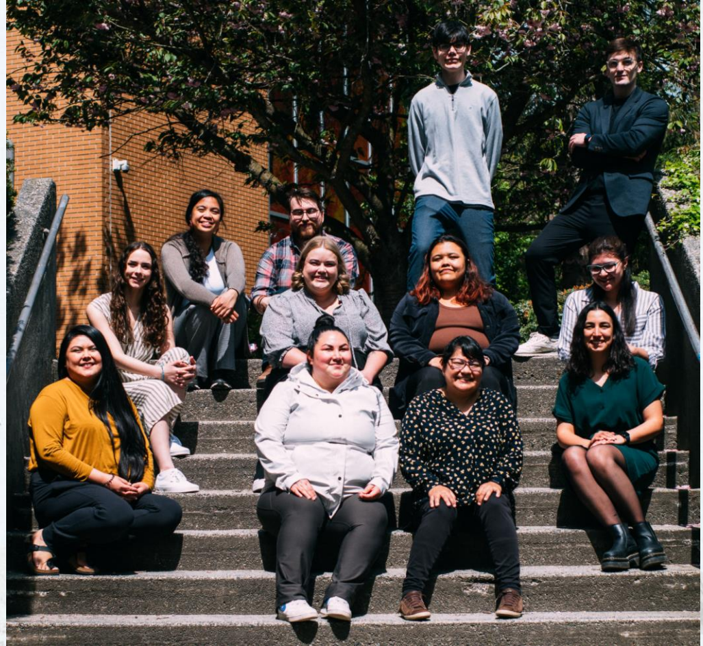
May 2023 Orientation