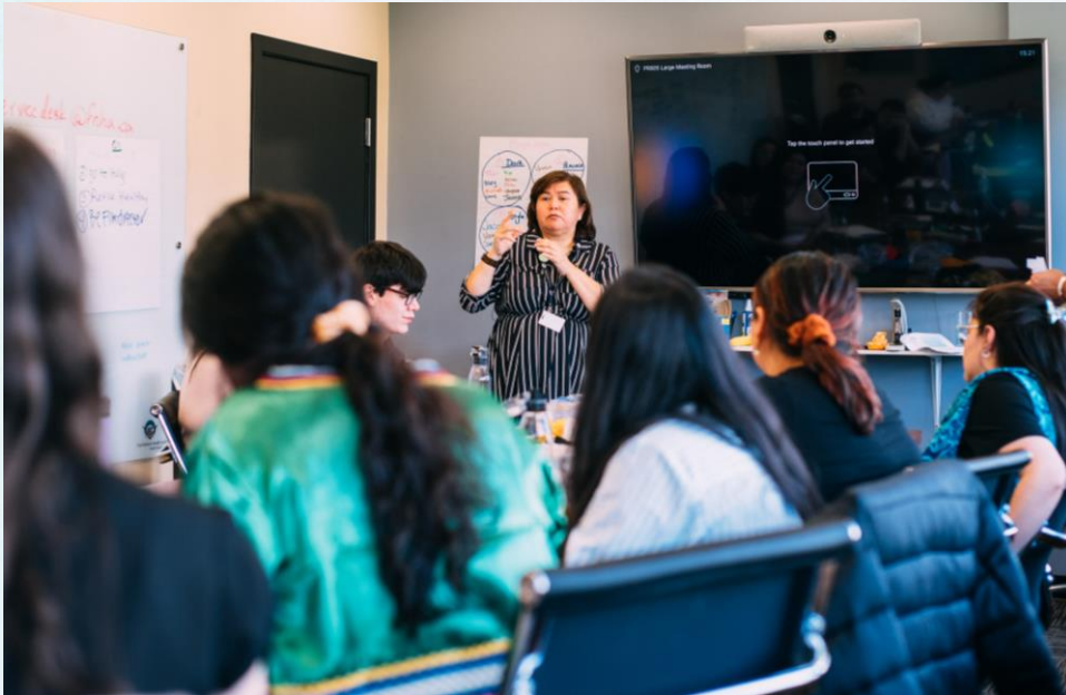
May 2023 Orientation

Two day in-person orientation in West Vancouver (Park Royal office)