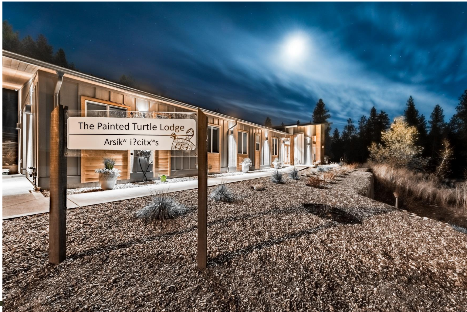
ROUND LAKE PAINTED TURTLE LODGE