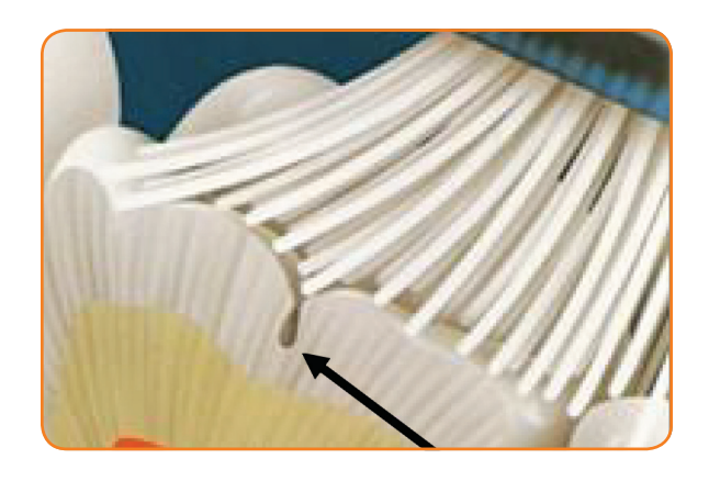
50% of cavities happen in these deep grooves.