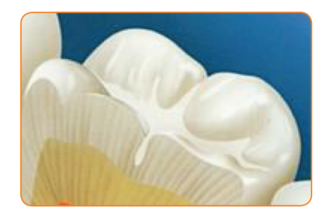
These grooves filled with sealants stop 50% of cavities from starting.