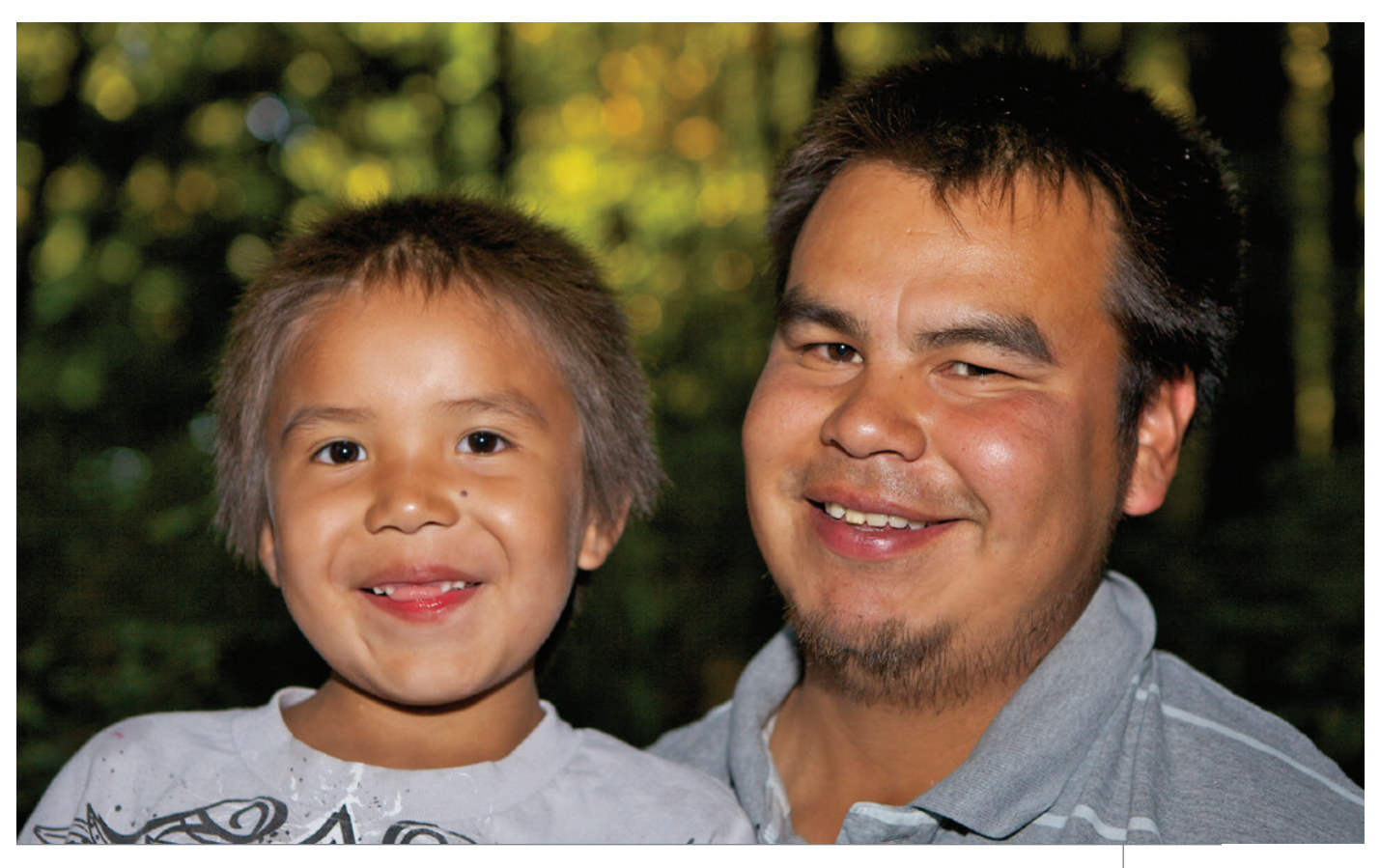
Healthy Smiles for Life: BC's First Nations and Aboriginal Oral Health Strategy

"There has been a huge reduction in the need for children to be treated under general anaesthetic in Terrace. In 2010-2011, not one lskut child needed this treatment, and now there are even teens who have had no cavities. Having a dental therapist has significantly improved the health of our community!"