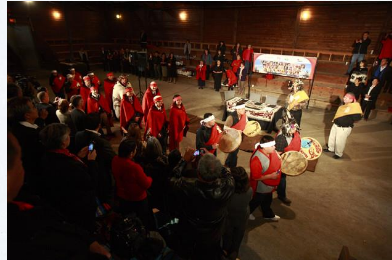
First province-wide health authority of its kind in Canada