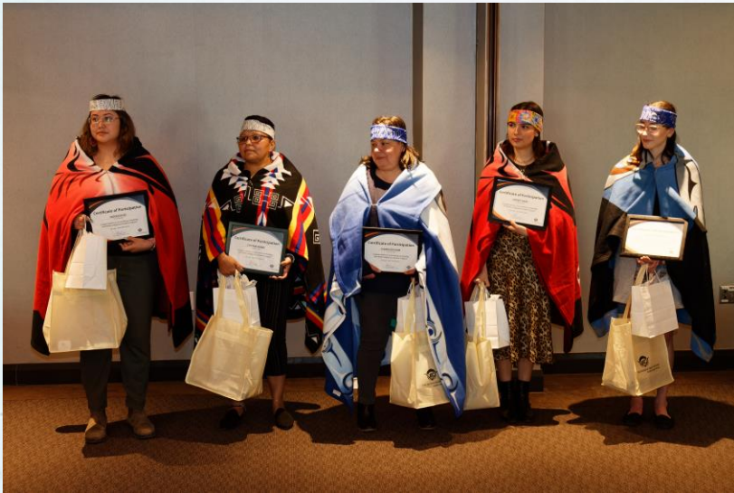
April 2023 End of Term Ceremony

We take into account your studies – we also look at your interests and top choices