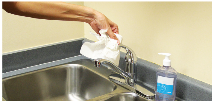
6. Turn off tap with the paper towel.

For more information: https://www.fnha.ca/coronavirus