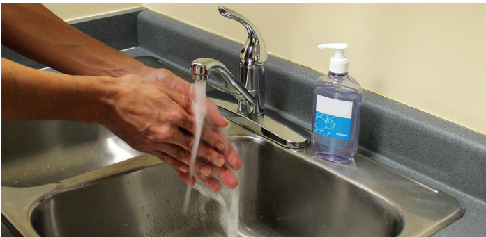
1. Wet your hands.

Wash your hands often to keep your community safe and healthy.