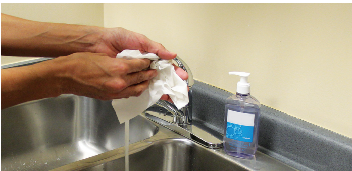
5. Dry your hands with a paper towel.