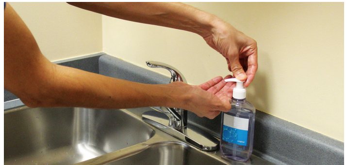
2. Apply enough liquid soap to cover your hands.