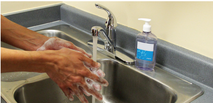
3. Lather and scrub your whole hand, including the front, back and fingers - 20 seconds.