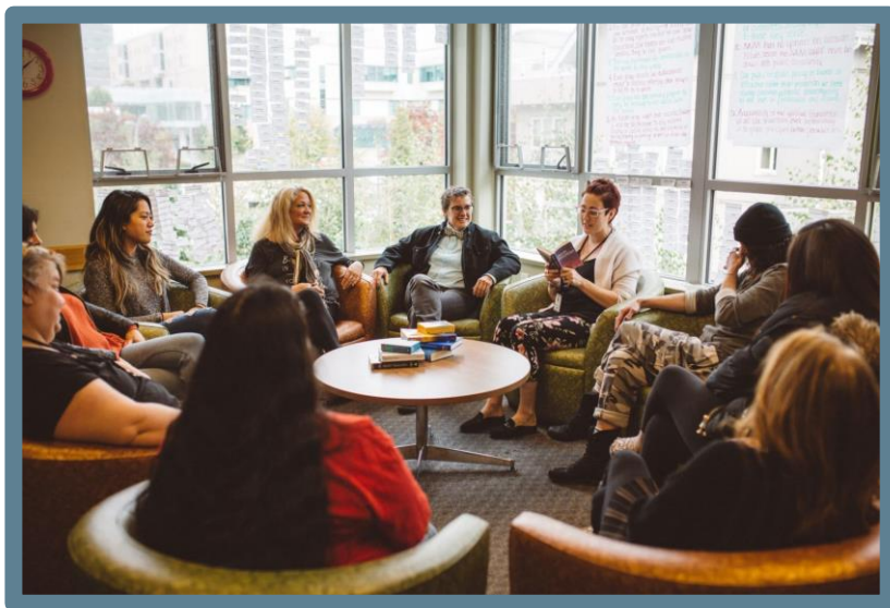
Phoenix Society (38 Beds)

Sharing wise, community-driven practices for wholistic wellness