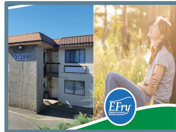
Elizabeth Fry Abbotsford 12 Beds for adult women (LGBTQ2S+ trans non-binary)