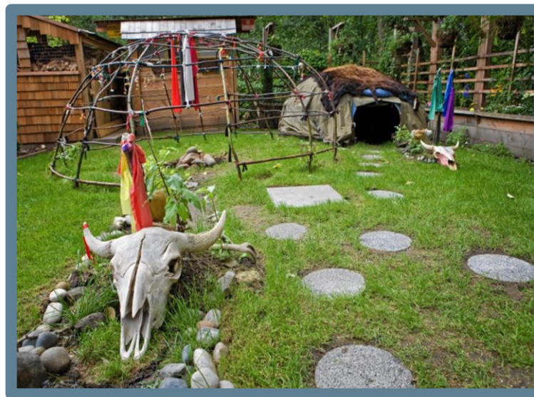
Phoenix Society Sweat Lodge