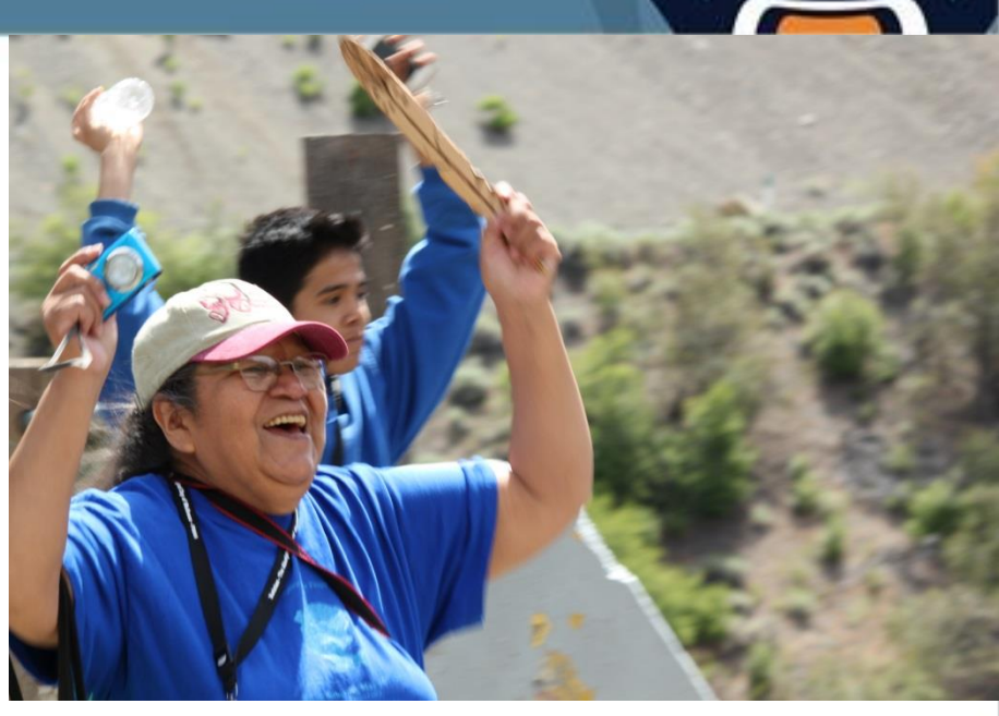
At Xwisten, Elder completing first 10km run!