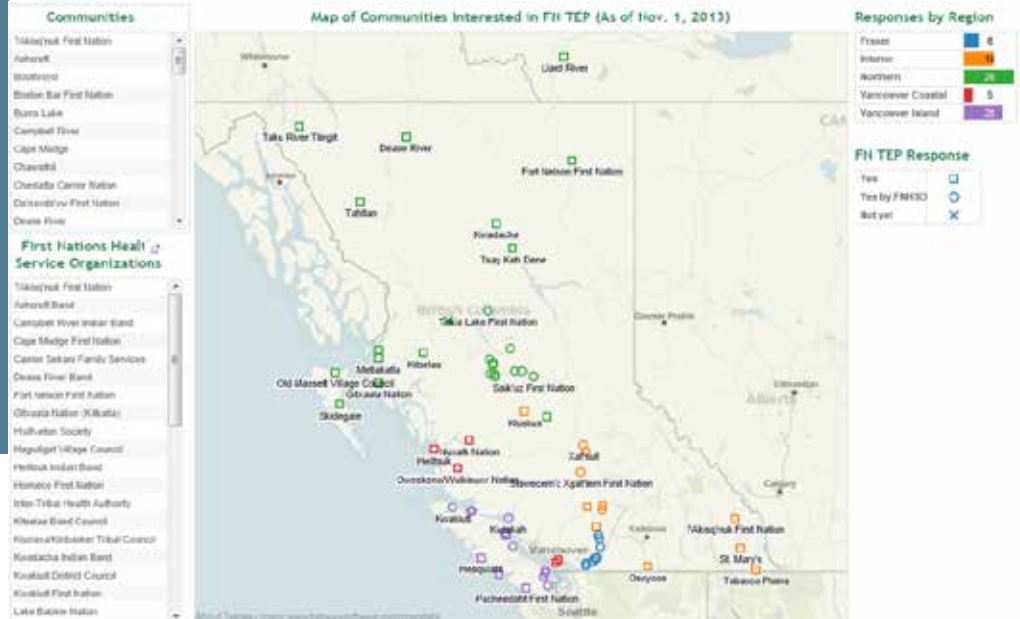
Right: Tableau Map of potential Wave 1 First Nations communities for Telehealth expansion

As of November 1st, First Nations Health Service Organizations representing 64 communities across the province had expressed interest in the project.