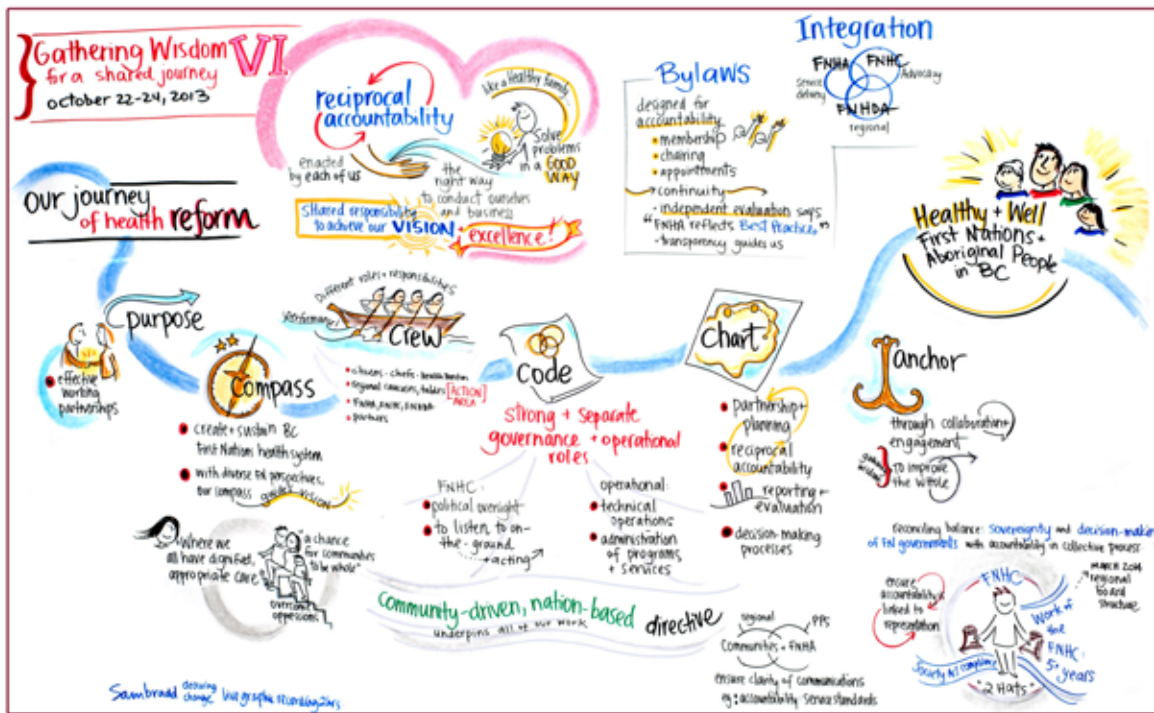
Above: Graphic illustration of the reciprocal accountability discussion at Gathering Wisdom for a Shared Journey VI.

We also would like to take this opportunity to thank all the leaders and champions that participated in the inaugural FNHC Leadership Challenge - Beefy Chiefs and Champions. It is through your commitment to this challenge that we were able to bring forward the awareness to health concerns facing our communities today. To honour the achievements of this year's winners, we have featured a story in our recent FNHA Spirit magazine ( http://www.fnha.ca/SpiritMagazine/Spirit_Fall2013.pdf ) that includes a brief summary on each winner. We will also be featuring a 'where are they now' update from the Beefy Chief winners in the next issue of the Spirit Magazine. We ask that you keep posted on the next wellness challenge as we have a lot of great prizes coming to you and your community!