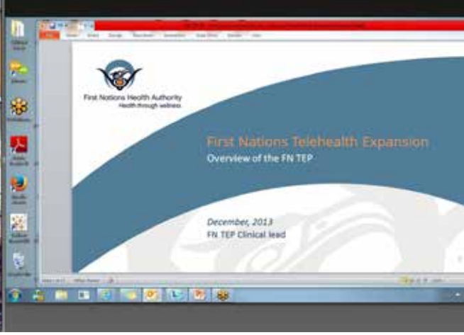
Photo (l) Telehealth Booth at Gathering Wisdom for a Shared Journey VI. Photo (r) FN TEP Connects with Three Corners to talk Telehealth

participants in Vancouver also spoke directly with nurses and doctors located in Bella Bella and Takla Lake about the positive outcomes they have experienced with telehealth.