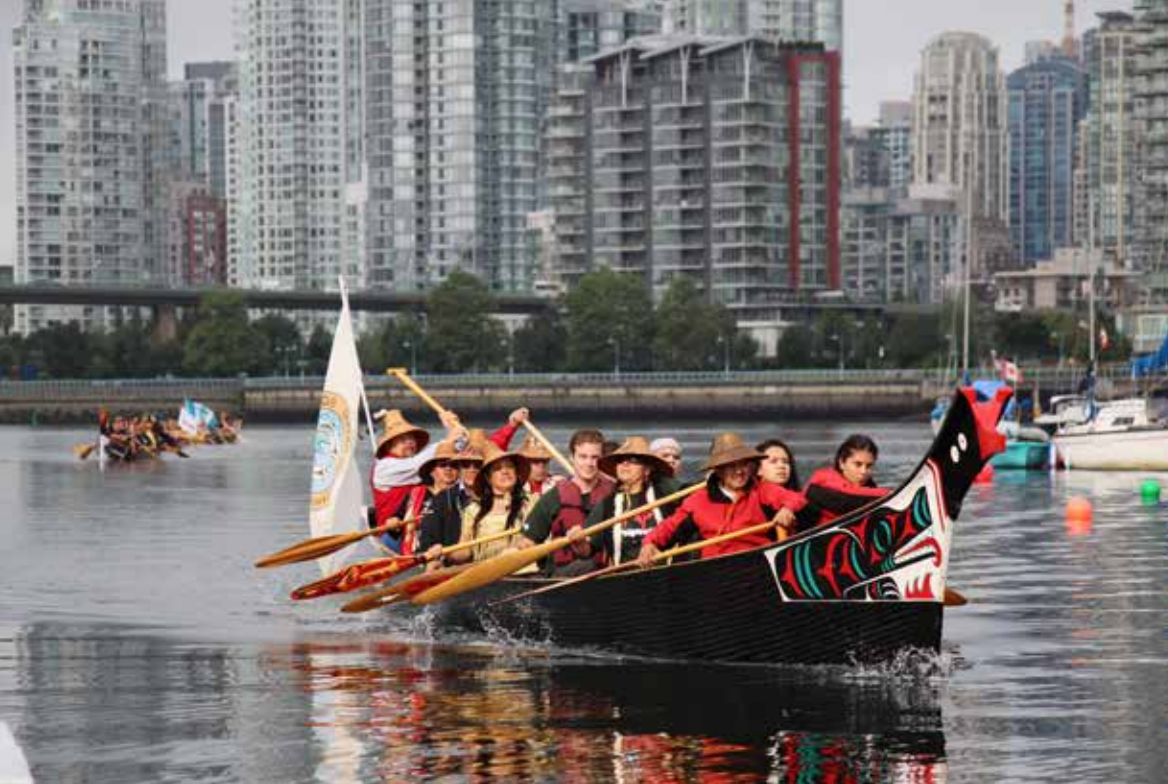
Left: Truth and Reconciliation Events September 2013