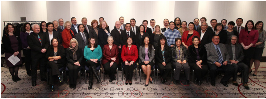
The 2012 Health Partnership Accord Signing ceremony.

The evolution of the FNHA and the health partnerships with BC and Canada to where it is today has created a great opportunity for BC First Nations. The table has been set at the regional level with Provincial Regional Health Authorities, and provincially with the Ministry of Health and Provincial Health Services Authority to realize the commitments made by the Province of BC to work with BC First Nations to improve their health status. Priorities identified by BC First Nations through regional health and wellness plans will guide the work at all levels within the provincial health system and the FNHA.