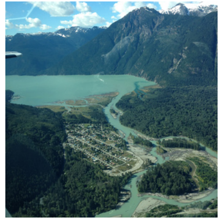
An arial view of Bella Coola.