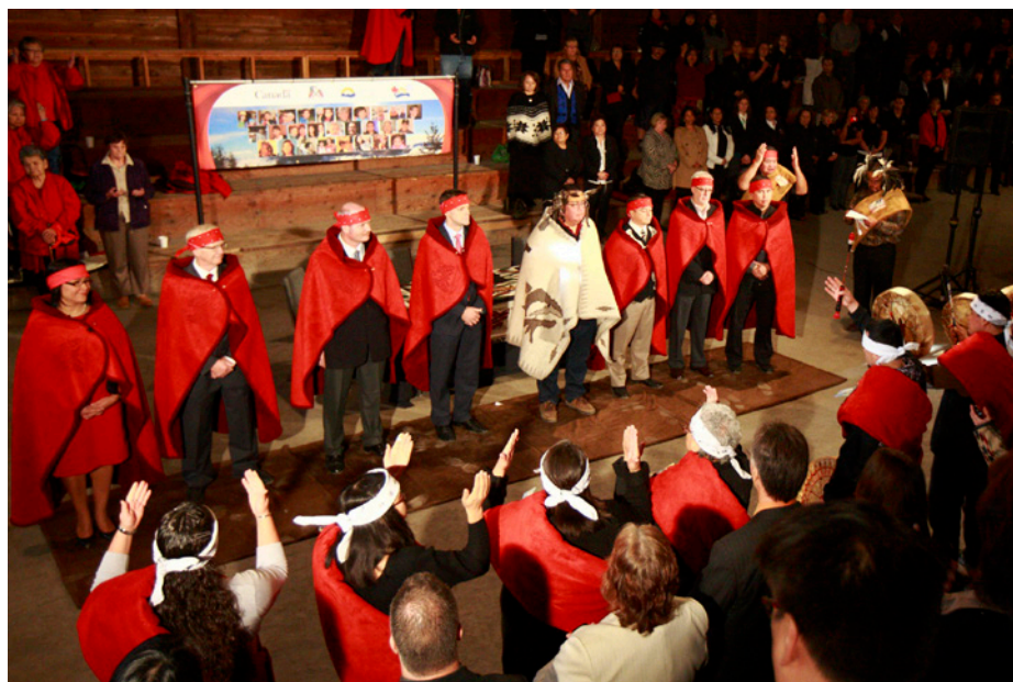
The 2011 Tripartite Framework Agreement on First Nations Health Governance Signing ceremony.

The signing of the Framework Agreement in October 2011 initiated the transition period which set out the important work specifically to enhance the health partnership with the Province and its Health Authorities to collaborate on better access to provincial services for First Nations people, as well as working with Health Canada on the transfer of First Nations and Inuit Health Branch BC Region responsibilities and functions to the FNHA. The transfer was completed on October 1, 2013 with service continuity agreements in place to support infrastructure requirements for the FNHA that extend the transition period for up to 2 years.